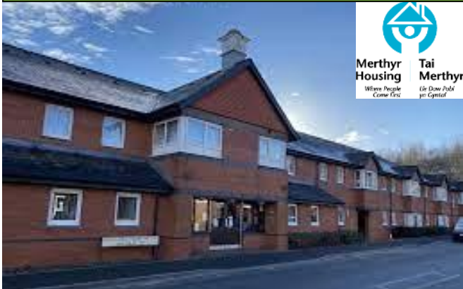
KEVIN RYAN COURT