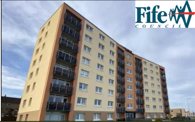
FORTH VIEW, KIRKALDY